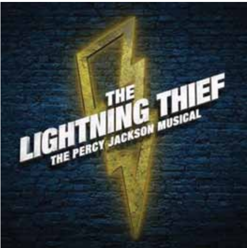
Spring Musical at Seaholm High School

See page 16 for location map, addresses and phone numbers for the elementary schools above.